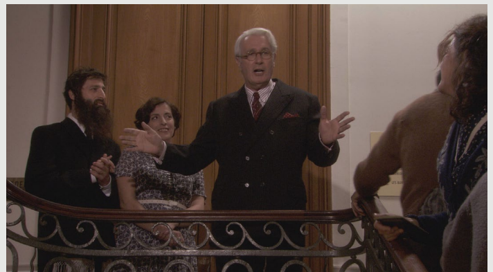
Above: Film stills from Disobedience: The Sousa Mendes Story .