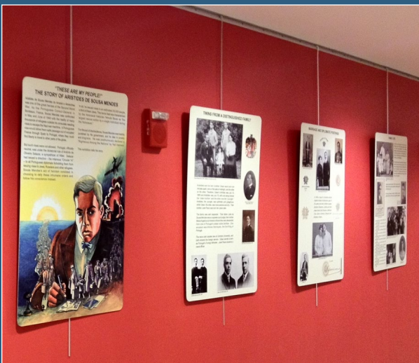
Image: Installation shot from Cambridge Public Library, June 2014